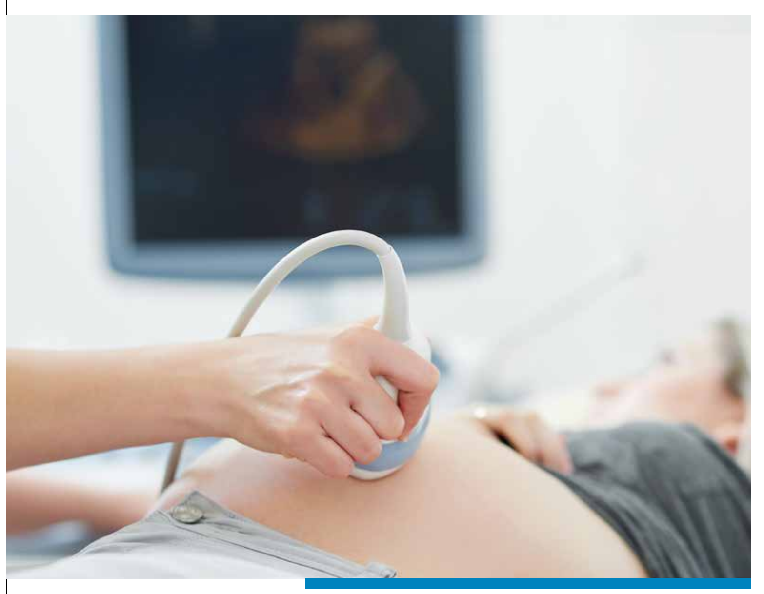
<sup>7</sup>Medicare Benefits Schedule: November 1998 and January 2019. <sup>8</sup>ADIA analysis of 2017-18 Medicare statistics.