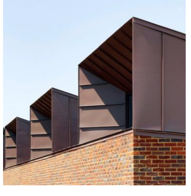
My home Street presentation Connection Belonging Public / Private entry points