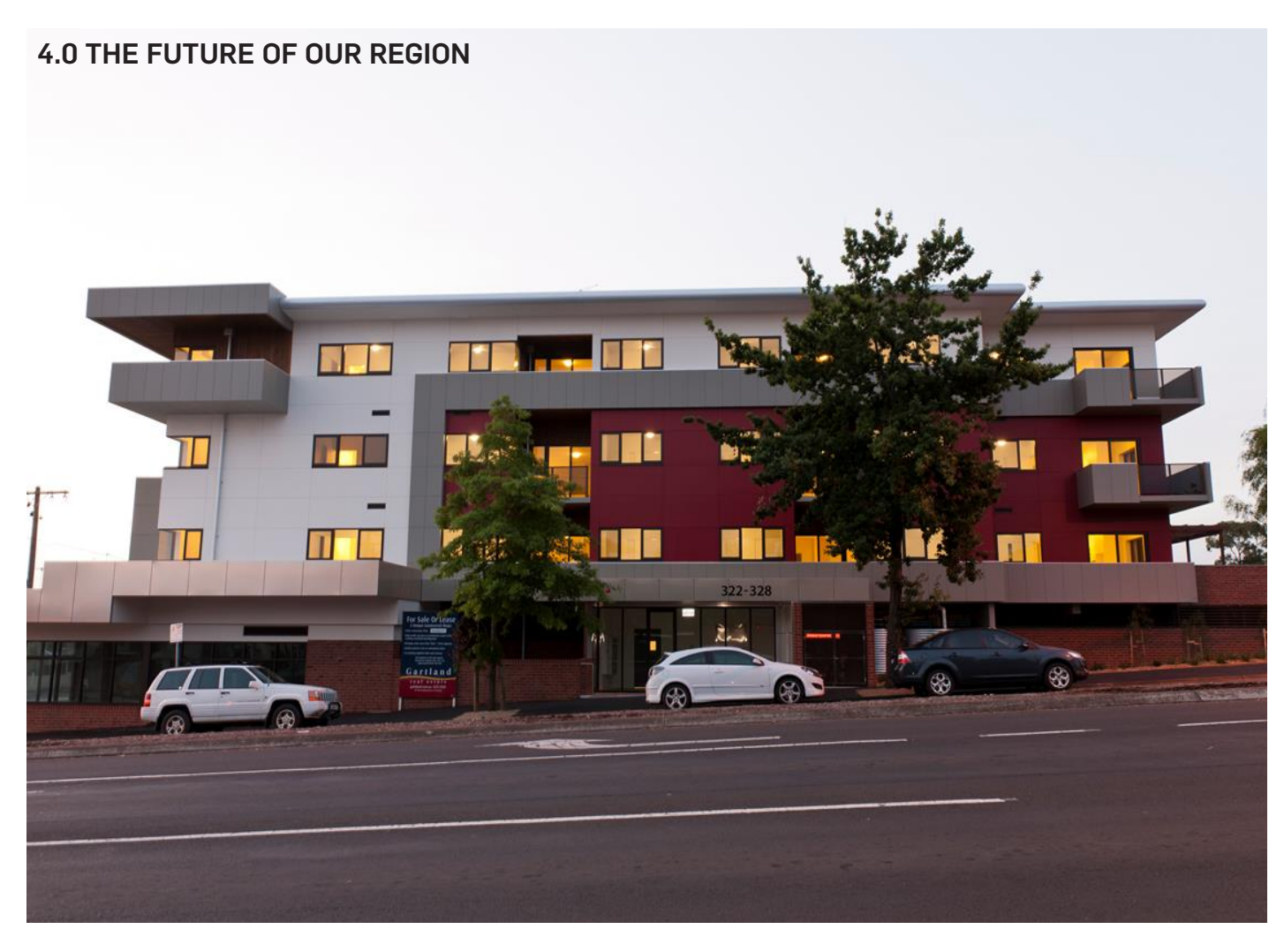
HAVEN; HOME, SAFE