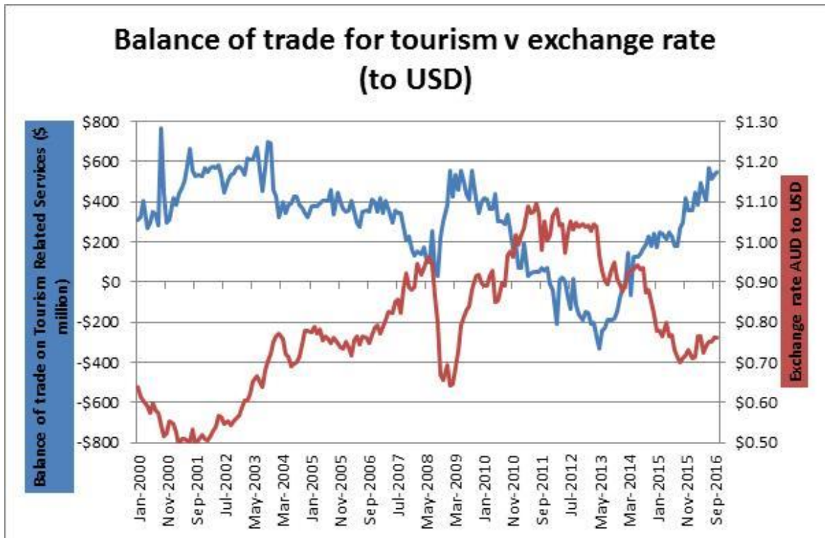
Figure 1: Exchange rate impacts on tourism