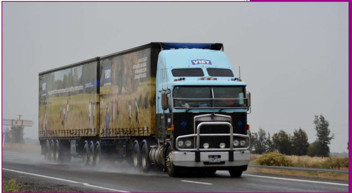
Mareeba western bypass