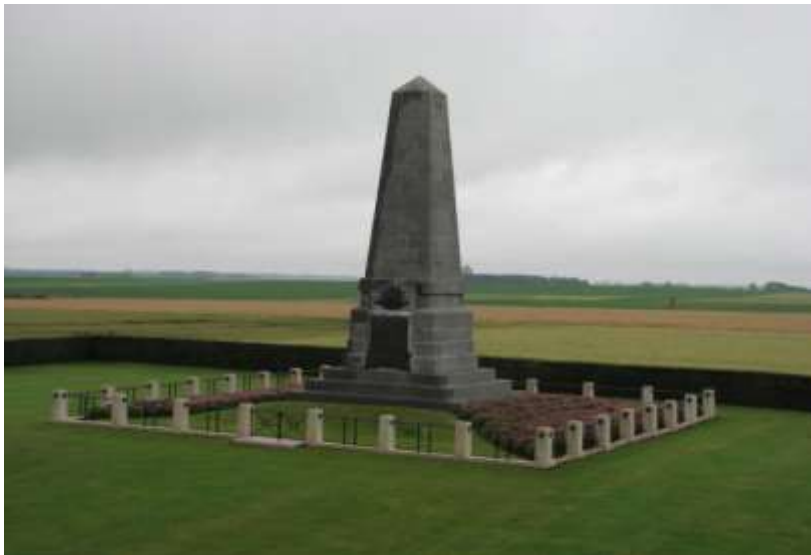
1 st Australian Division Memorial, Pozières