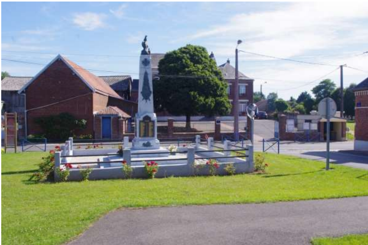
The Pozières School (Ecole) today on the ground floor beneath the Town Hall (Mairie)

It is proposed the primary school be built on 5000 square metres of land already allocated by the Pozières Council.