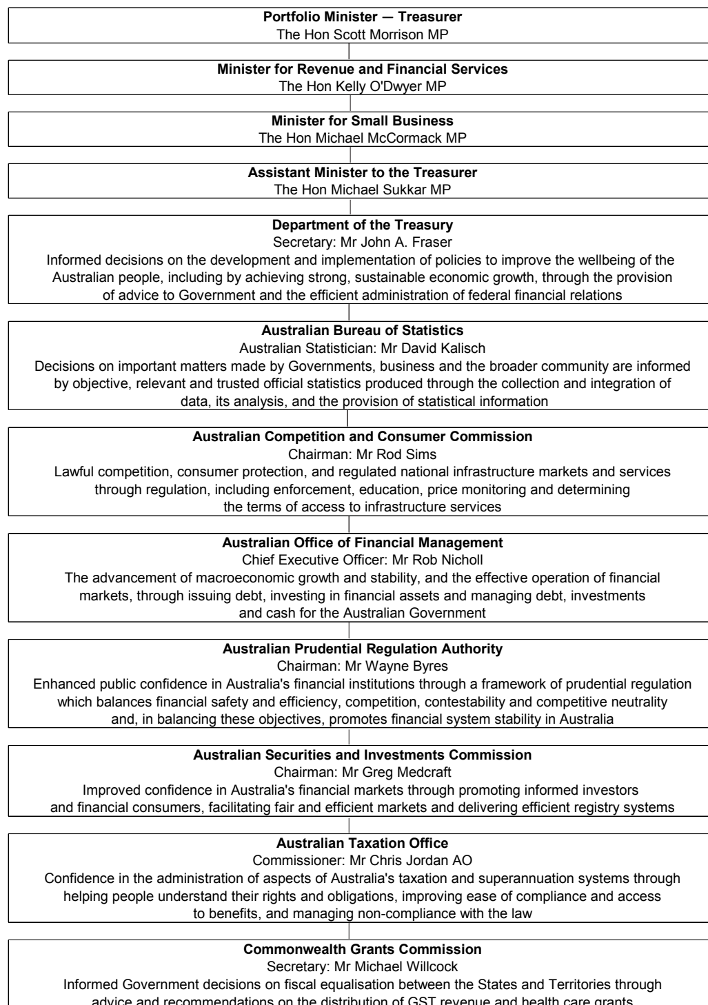
Figure 1: Treasury portfolio structure and outcomes