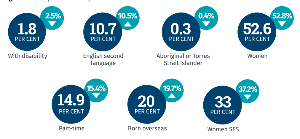
Figure 5: Workplace diversity

In 2016, the Treasury received accreditation as a White Ribbon Workplace. This accreditation recognises the commitment to addressing family and domestic violence, particularly violence against women.