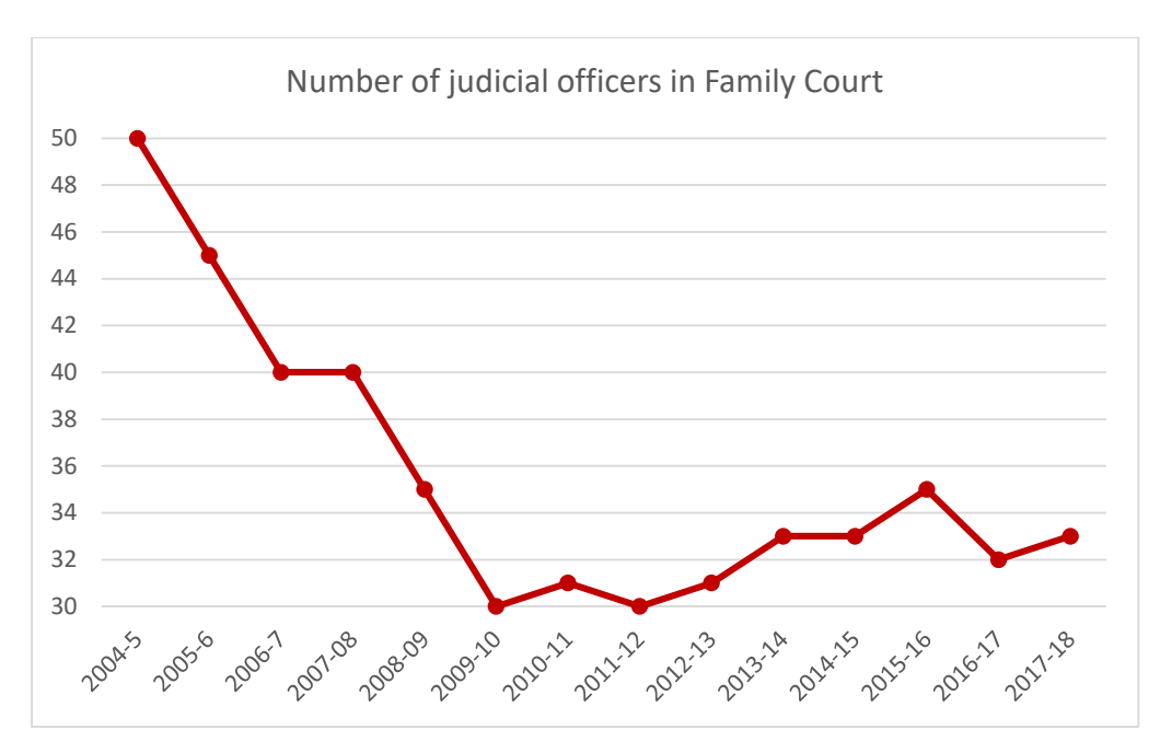
Data source: Family Court Annual Reports