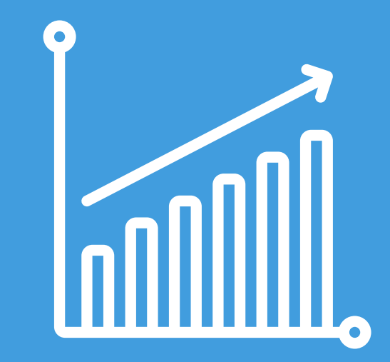
By 2030 over 6.2 million Australians will be affected by incontinence.

Labour force participation by people with severe incontinence is less than half that of people without severe incontinence