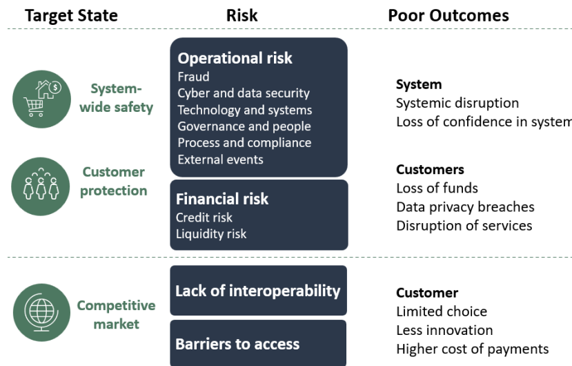
Table 2: Key risks in the payments system